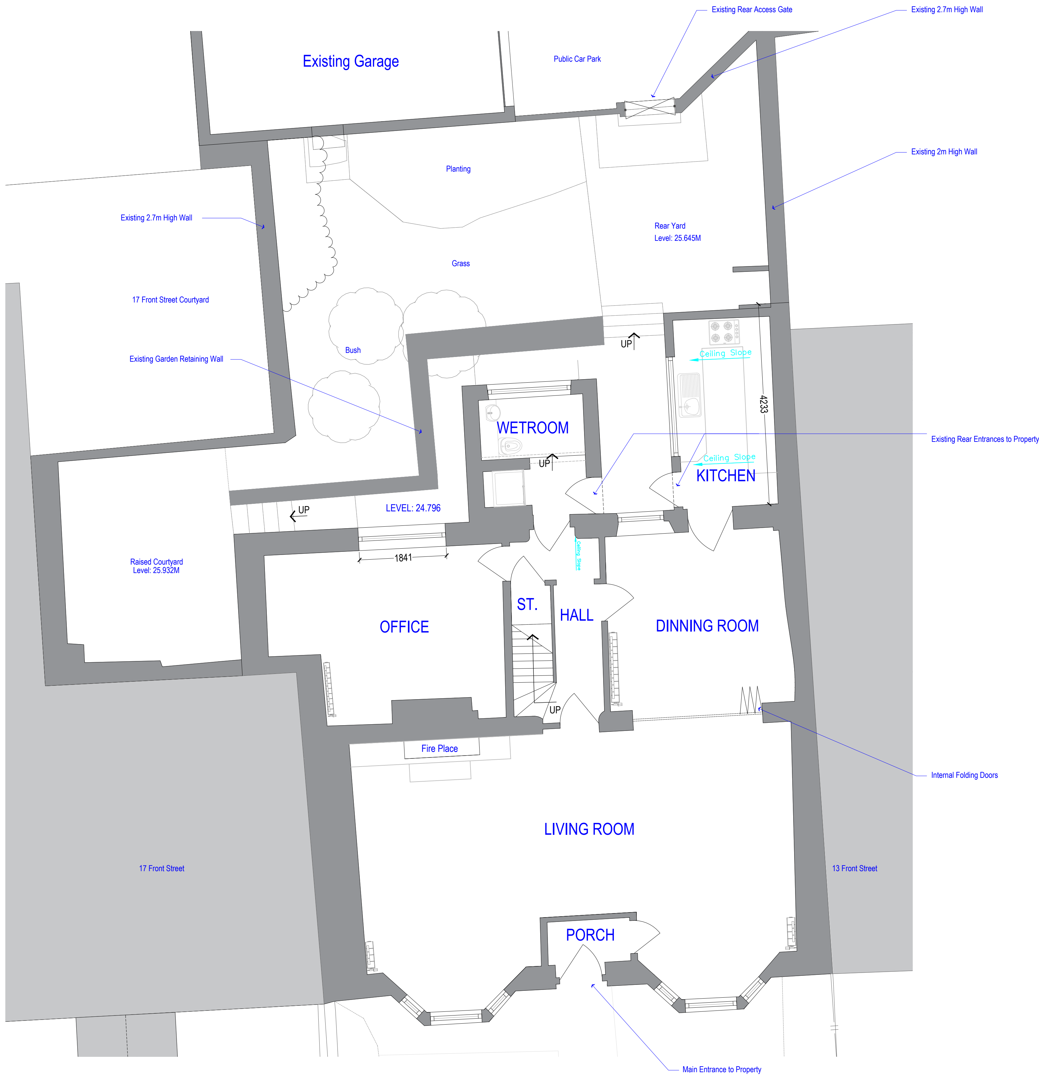
[01] EXISTING GROUND FLOOR PLAN