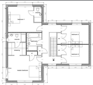
first floor GIA 109 sqm